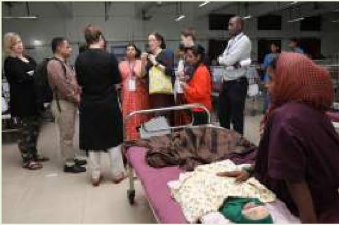
Adolescent girls residential camp