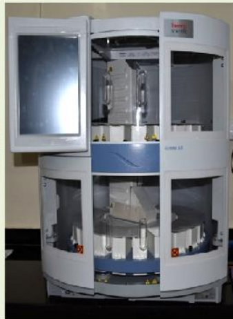
Automatic Slide Stainer