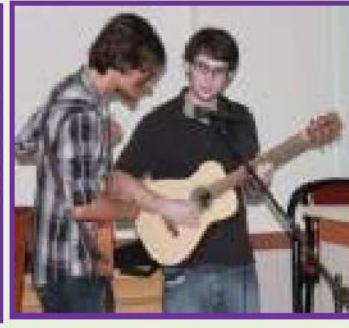
Medical Students from Chicago