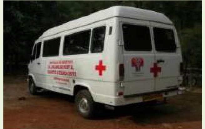
गरोदर माते साठी २४तास मोफत ॲंब्युल्स सेवा