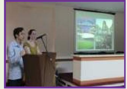
Oxford University (U.K.)