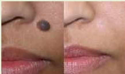
Before After Cryotherapy