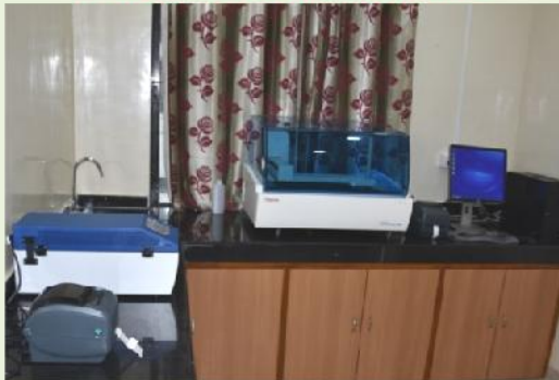
Automatic IHC Analyser