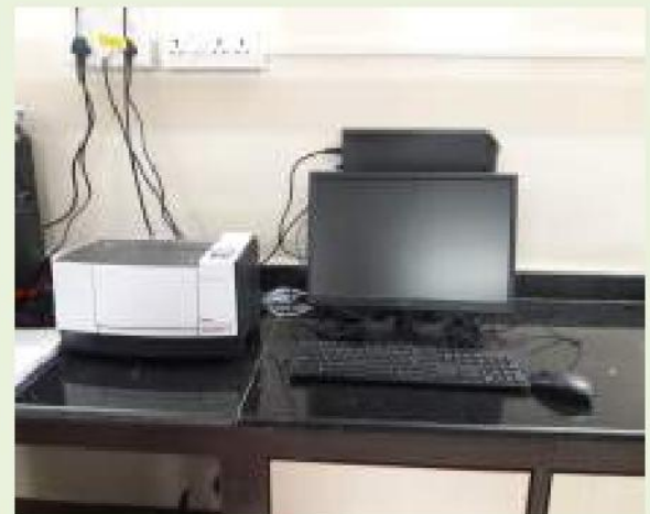
FT-IR (Infrared spectroscopy)