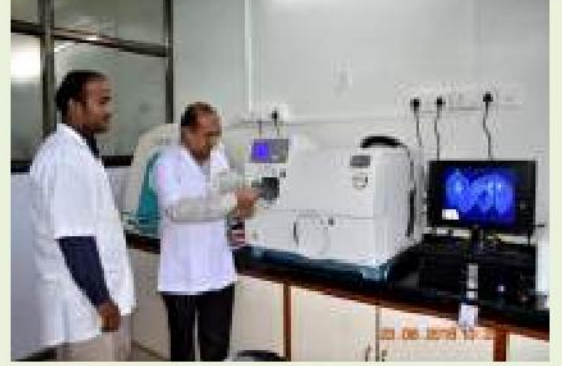
क्षयरोगाची तपासणी: थुंकीची तपासणी जीन एक्सपर्ट मशिनद्वारे (GeneXpert)