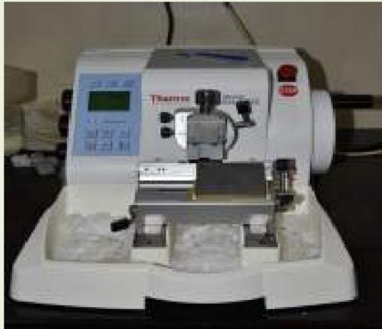
Fully Automatic Microtome