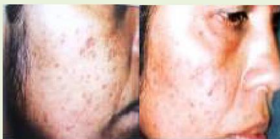
Before After Microdermabrasion

महाराष्ट्र शासन आरोग्य सेवा (कुष्ठरोग निर्मूलन) व भ.क.ल.वालावलकर रुग्णालय/वैद्यकीय महाविद्यालय संचालित ‘कुष्ठरोग संदर्भ सेवा केंद्र’ (Leprosy Referral Centre) स्पृह-त्वचारोग विभाग (ओ.पि.डी.क्र.१०) वेळ-सकाळी ९ ते संध्याकाळी ५ वाजेपर्यंत