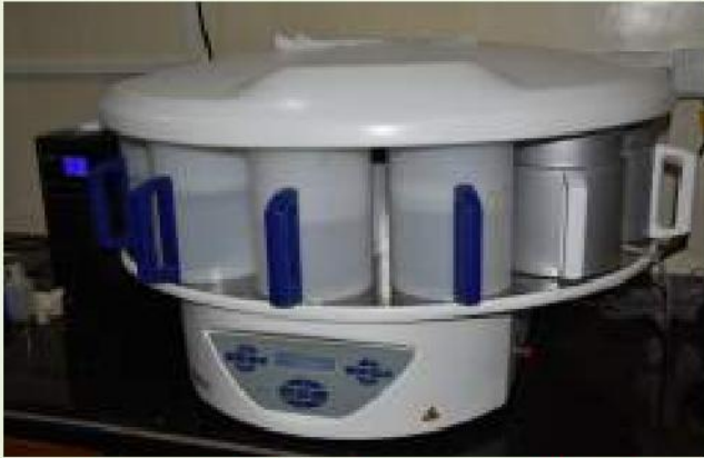
Automatic Tissue Processor –Histokinete