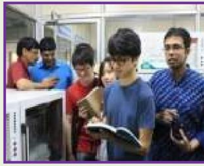
National University of Singapore (Singapore)