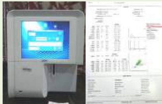
5 part Haematology Analyser