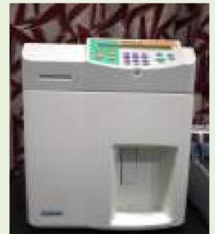
3 part Haematology Analyser