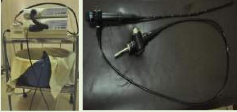
दुर्बिणीद्वारे श्वासनलीका तपासणी

I.C.U. is equipped with adult as well as pediatric ventilator.