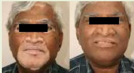
Before After पांढरे कोड (Vitiligo – PUVA Therapy)