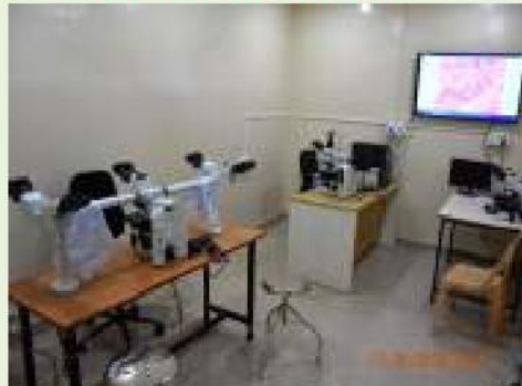
Penta Head Microscope