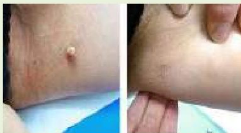
Before After Electrocautery (To remove unwanted or harmful tissue)