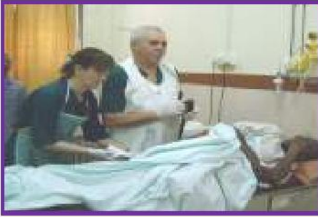
Doctors from Czech Republic