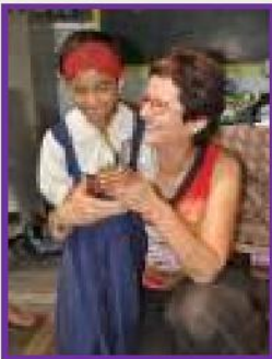
Barcelona University (Spain)