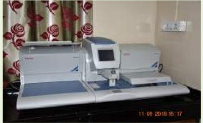
Automatic Embedding Module