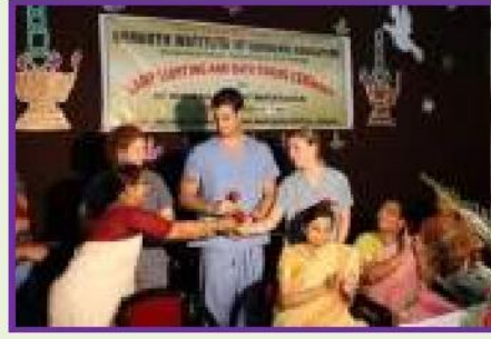
Rosalind Franklin University (USA),