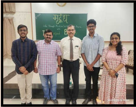
Felicitation & welcome