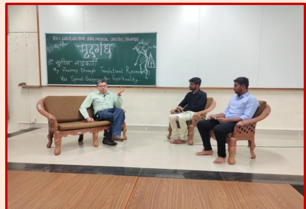
Interviews of the Stalwards in Medicine