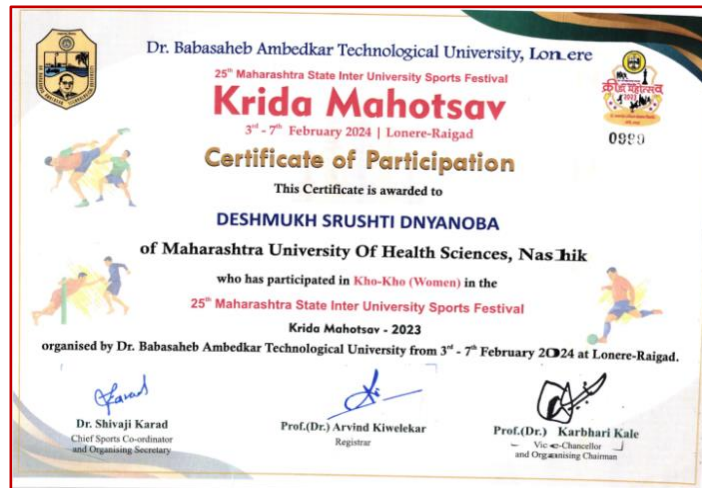
Miss. Srushti Deshmukh Kho-Kho Female (2023-24)